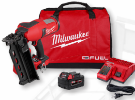
M18 FUEL™ Duplex Nailer Kit (2844-21)