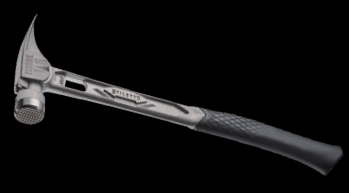
TI-BONE™ 15 oz Milled/Curved Titanium Framing Hammer (TIB15MC)