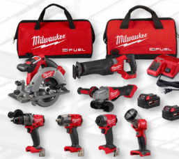
M18 FUEL™ 7-Tool Combo Kit (3697-27)