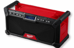
M18™ Bluetooth® Jobsite Radio - Tool Only (2952-20) $249 VALUE