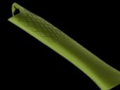
TRIMBONE™ Replacement Grip - Green (TBRG-G)