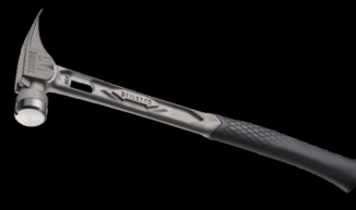
TI-BONE™ 15 oz Smooth/Curved Titanium Framing Hammer (TIB15SC)