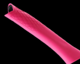
TRIMBONE™ Replacement Grip - Pink (TBRG-P)