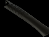
TRIMBONE™ Replacement Grip - Black (TBRG-B)