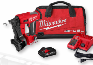
M18 FUEL™ Coil Roofing Nailer Kit (2909-21)