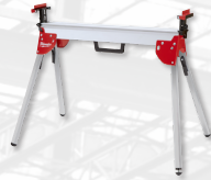
Folding Miter Saw Stand (48-08-0551) $229 VALUE