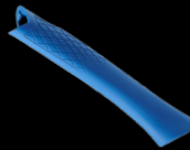
TRIMBONE™ Replacement Grip - Blue (TBRG-BL)