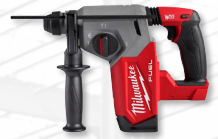
M18 FUEL™ 1" SDS Plus Rotary Hammer - Tool Only (2912-20) $498 VALUE