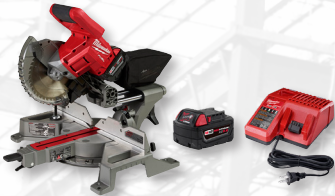
M18 FUEL™ 7-1/4" Dual Bevel Sliding Compound Miter Saw Kit (2733-21)