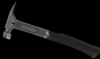
TRIMBONE™ 10 oz Smooth/Curve Titanium (TRMB)